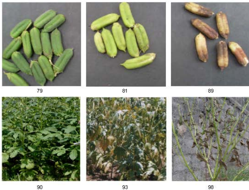
Fig. 3: Ripening and drying phases (79-98) of Sesamum indicum L.